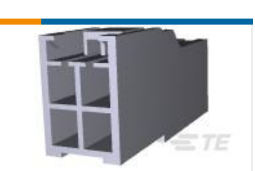
TE Part #176284-1 AMP UNIVERSAL POWER CAP 4P