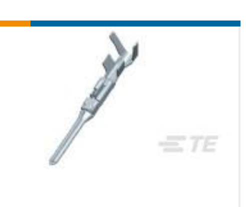
TE Part #175154-1 UNIV POWER TAB CONT L /P