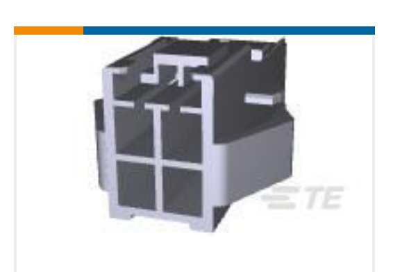
TE Part #176294-1 UNIV POWER CAP HSG 4P P/MOUNT