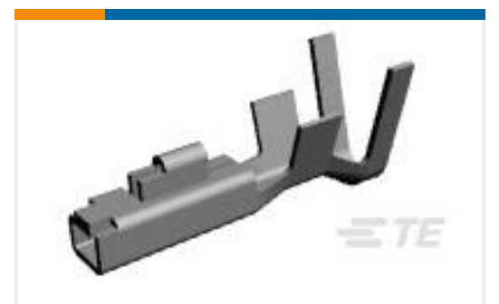
TE Part #175156-1 UNIV POWER REC CONT L /P