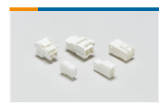
Rectangular Power Connectors(178)