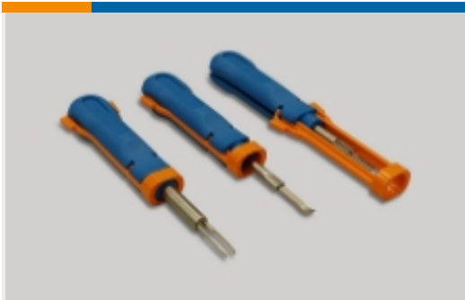
Insertion & Extraction Tools (1)