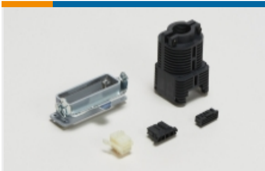
Rectangular Connector Housings(4)