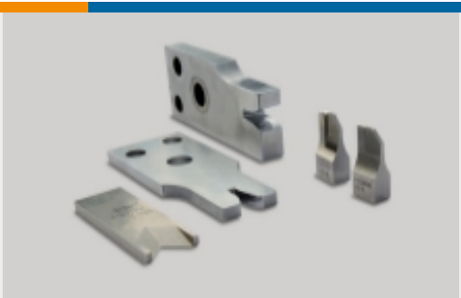
Spare & Wear Tooling(1)