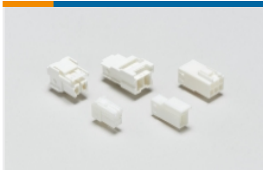
Rectangular Power Connectors(6)