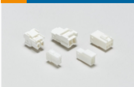
Rectangular Power Connectors(1)