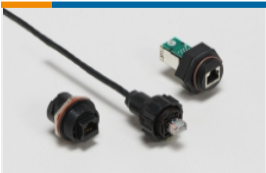
Circular RJ45 Connectors(6)