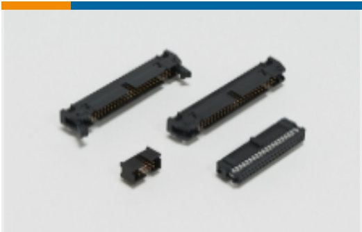
Ribbon Cable Connectors (203)