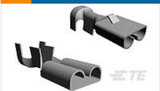
TE Part #150571-2 FF 110 REC 0.2-0.56MM2 TPBR