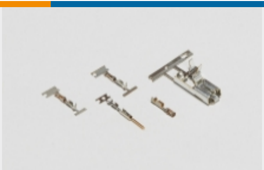
Wire-to-Board Connector Contacts(4)