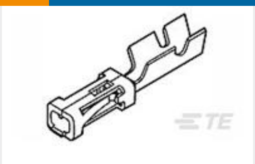
TE Part #166309-2 MOD-5 REC.CONTACT