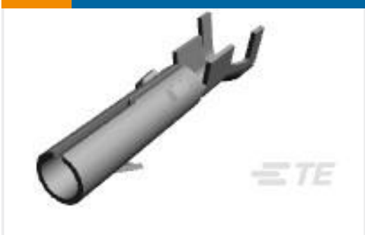
TE Part #163300-8 MATENLOK SOCKET