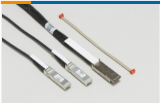
Pluggable I/O Cable Assemblies(54)

limits as defined in the Annexes of Directive 2011/65/EU (RoHS2). Finished electrical and electronic equipment products will be CE marked as required by Directive 2011/65/EU. Components may not be CE marked. Additionally, the part numbers that TE has identified as EU ELV compliant have a maximum concentration of 0.1% by weight in homogenous materials for lead, hexavalent chromium, and mercury, and 0.01% for cadmium, or qualify for an exemption to these limits as defined in the Annexes of Directive 2000/53/EC (ELV). Regarding the REACH Regulations, TE's information on SVHC in articles for this part number is still based on the European Chemical Agency (ECHA) 'Guidance on requirements for substances in articles' (Version: 2, April 2011), applying the 0.1% weight on weight concentration threshold at the finished product level. TE is aware of the European Court of Justice ruling of September 10th, 2015 also known as O5A (Once An Article Always An Article) stating that, in case of 'complex object', the threshold for a SVHC must be applied to both the product as a whole and simultaneously to each of the articles forming part of its composition. TE has evaluated this ruling based on the new ECHA "Guidance on requirements for substances in articles" (June 2017, version 4.0) and will be updating its statements accordingly.