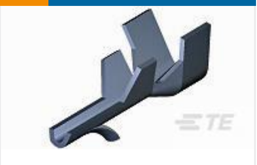
TE Part #925819-3 MINI AMP-IN 26-22 AWG