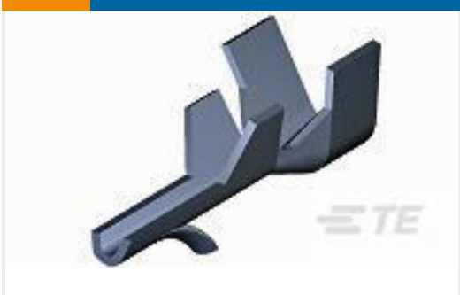
TE Part #925819-3 MINI AMP-IN 26-22 AWG