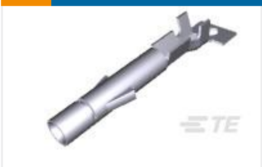
TE Part #926884-3 UNIV.M-M-L.SOCKET