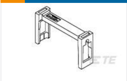
TE Part #5-100103-0 50P.A/L.STRAIN REL.