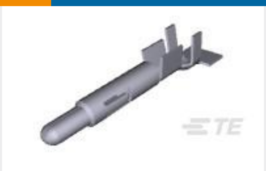
TE Part #926887-3 UNIV.M-N-L.PIN