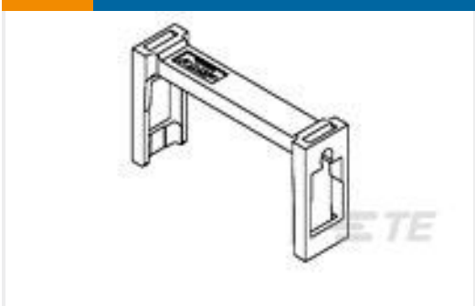
TE Part #3-100103-4 34P.A/L.STRAIN REL.