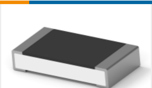
TE Part #4-2176391-3 RQ 1206 34K 0.1% 10PPM 5K RL