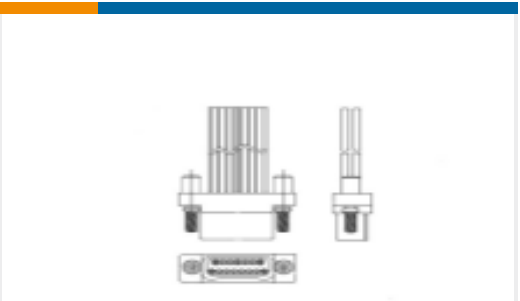
TE Part #1589472-1 STG009PC2DNC70N = WDUALOBE