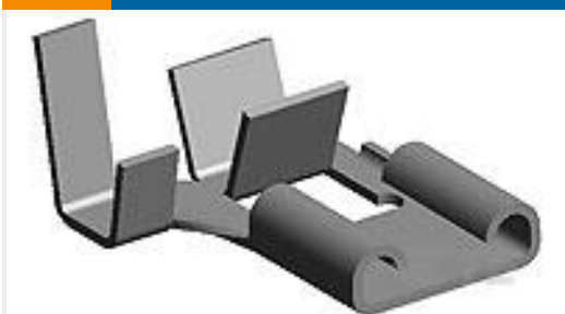
TE Part #63314-2 FASTON 250 FLAG REC 18-14 AWG TPBR