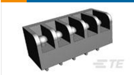
TE Part #4-1437646-5 3PCV-05-006=3PCV ASSEMBLY