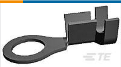
TE Part #42751-2 RING CRIMP 16-14 AWG TPBR