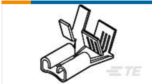
TE Part #63316-2 FASTON 187 FLAG REC 18-14 AWG TPBR