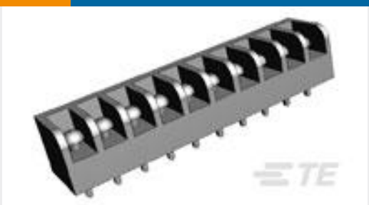
TE Part #6-1437646-2 3PCV-10-006=#3 TRIBARRIER TERM