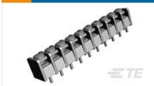
TE Part #3-1437667-3 4DB-P108-10=4DB ASSEMBLY