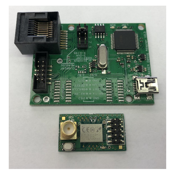
Figure 1. DVK Boards